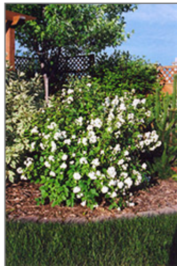
Buckley's Quill Mockorange in bloom

85 CHIEF JUSTICE CUSHING HWY SCITUATE, MA 02066 781-545-1266