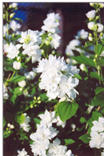
Buckley's Quill Mockorange flowers