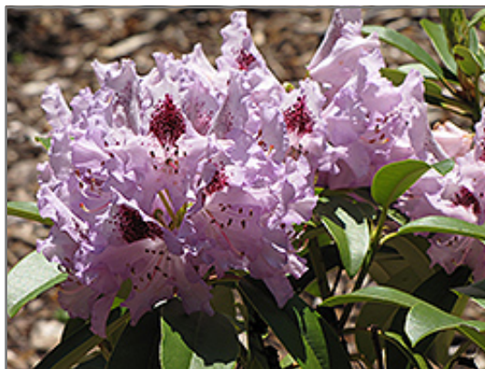
Purple Peter Rhododendron flowers

Captivating large purple blooms with dark purple blotches adorn this stately variety in mid spring; an accent or border shrub that will definitely stand out; absolutely must have well-drained, highly acidic and organic soil