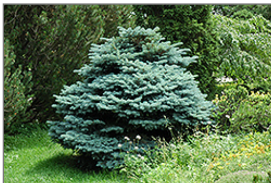
Globe Blue Spruce