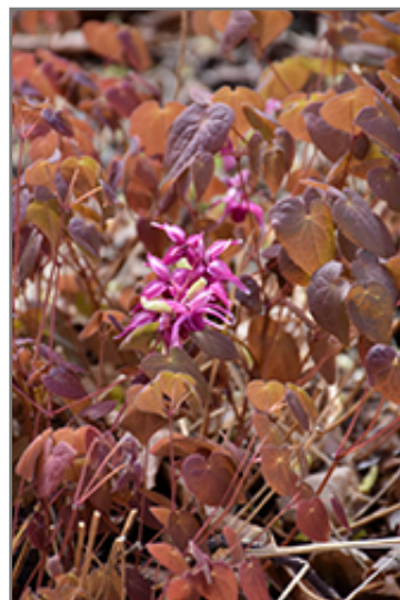
Yubae Bishop's Hat flowers