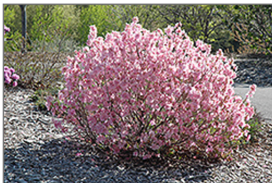
Cornell Pink Rhododendron in bloom