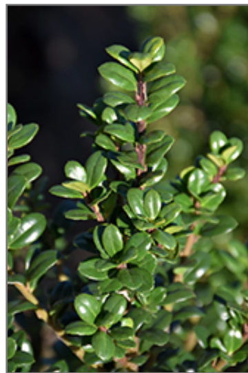
Steeds Japanese Holly foliage