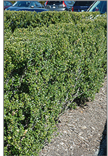
Steeds Japanese Holly

This shrub does best in full sun to partial shade. It prefers to grow in moist to wet soil, and will even tolerate some standing water. It is very fussy about its soil conditions and must have rich, acidic soils to ensure success, and is subject to chlorosis (yellowing) of the foliage in alkaline soils. It is highly tolerant of urban pollution and will even thrive in inner city environments. Consider applying a thick mulch around the root zone in winter to protect it in exposed locations or colder microclimates. This is a selected variety of a species not originally from North America.