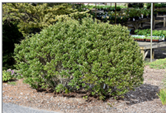
Steeds Japanese Holly

Steeds Japanese Holly is recommended for the following landscape applications;