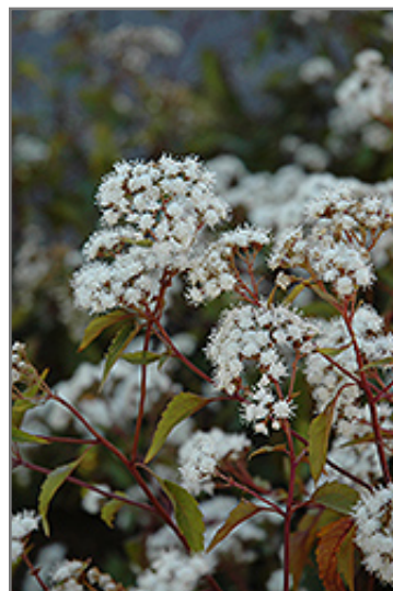
Chocolate Boneset flowers

Chocolate Boneset is recommended for the following landscape applications;