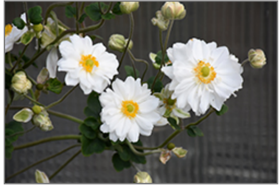
Whirlwind Anemone flowers