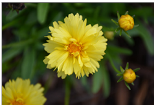
Leading Lady Charlize Tickseed flowers

Leading Lady Charlize Tickseed is recommended for the following landscape applications;