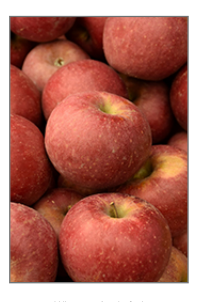
Winesap Apple fruit