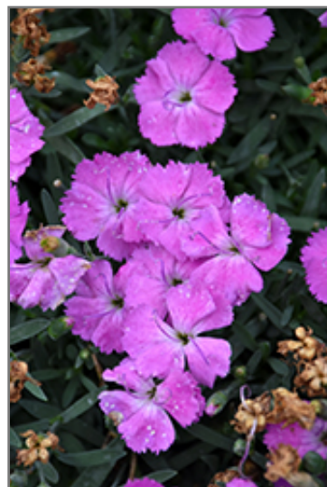
Paint The Town Fuchsia Pinks flowers

This is a relatively low maintenance plant, and is best cleaned up in early spring before it resumes active growth for the season. It is a good choice for attracting bees and butterflies to your yard, but is not particularly attractive to deer who tend to leave it alone in favor of tastier treats. It has no significant negative characteristics.