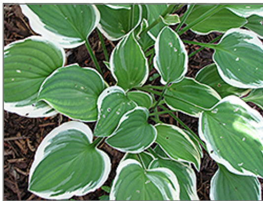
Diamond Tiara Hosta foliage

* This is a 'special order' plant - contact store for details