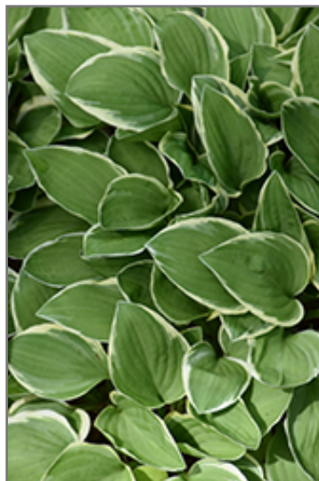
Diamond Tiara Hosta foliage