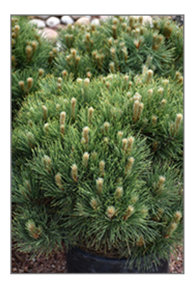
Morel Red Pine foliage

85 CHIEF JUSTICE CUSHING HWY SCITUATE, MA 02066 781-545-1266 www.kennedyscountrygardens.com