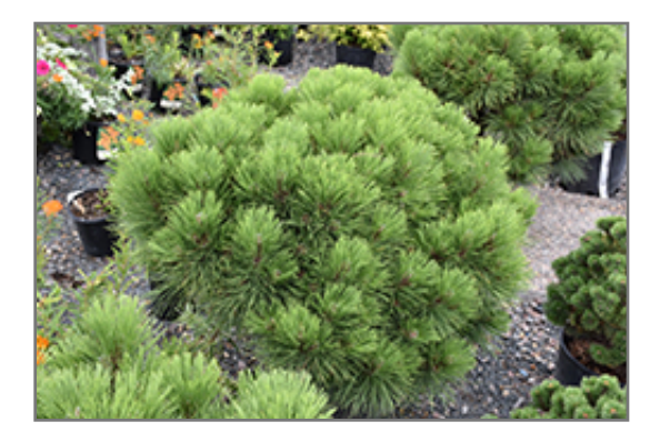
Morel Red Pine