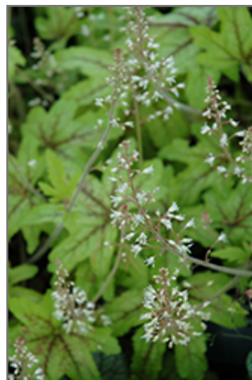
Alabama Sunrise Foamy Bells flowers