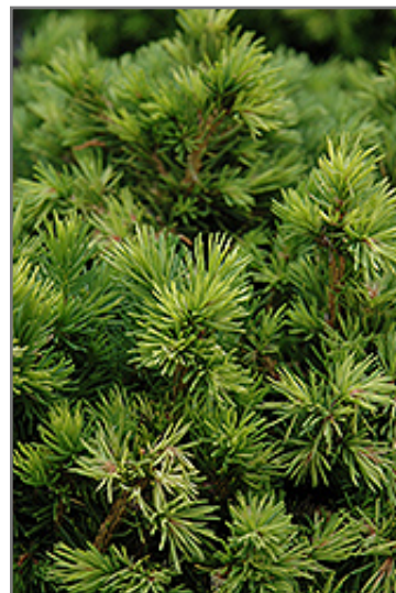
Tompa Dwarf Spruce foliage