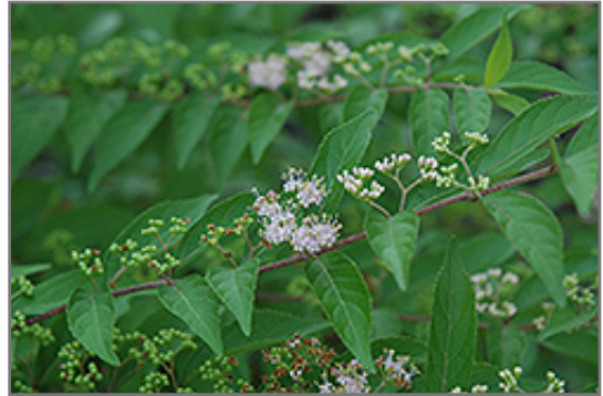
Issai Beautyberry flowers

Issai Beautyberry will grow to be about 4 feet tall at maturity, with a spread of 5 feet. It tends to fill out right to the ground and therefore doesn't necessarily require facer plants in front. It grows at a fast rate, and under ideal conditions can be expected to live for approximately 20 years.