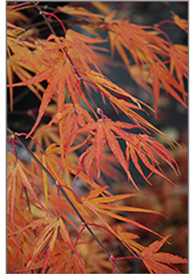
Scolopendrifolium Japanese Maple in fall

* This is a 'special order' plant - contact store for details