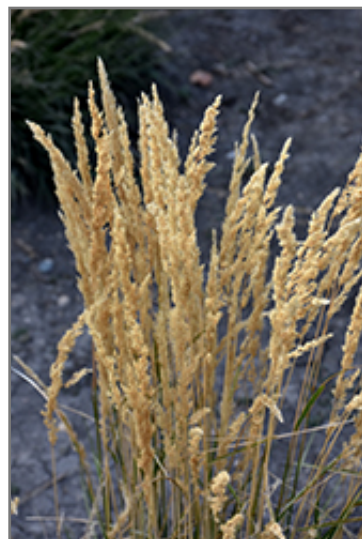
El Dorado Feather Reed Grass fruit

* This is a 'special order' plant - contact store for details