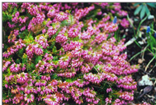
Gold Haze Heather flowers