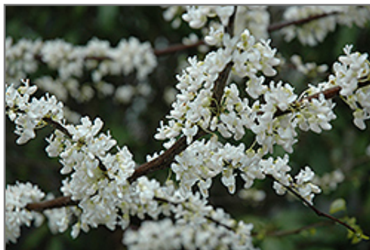
White Redbud flowers