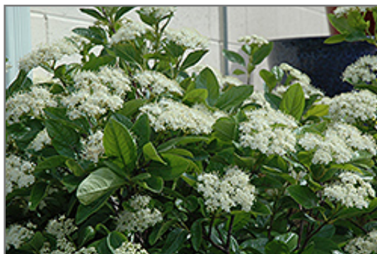
Winterthur Viburnum flowers

This is a relatively low maintenance shrub, and should only be pruned after flowering to avoid removing any of the current season's flowers. It is a good choice for attracting birds to your yard, but is not particularly attractive to deer who tend to leave it alone in favor of tastier treats. It has no significant negative characteristics.