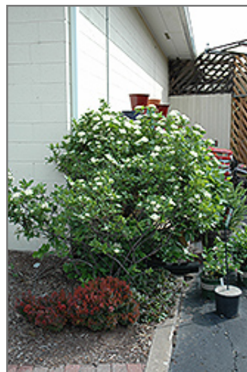
Winterthur Viburnum in bloom